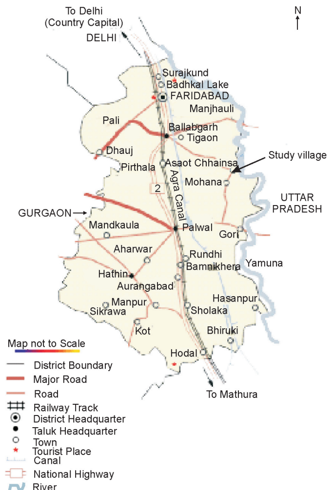
Fig. 1: Map of Faridabad (Haryana) showing village with malaria outbreak (study village—Chhainsa). (Source: http://www.haryana.nic ).

Yamuna in northern part of India. As a part of active malaria surveillance, health worker visits each house in the village to identify and notify fever cases in the community and make peripheral blood smears of all fever cases. In passive malaria surveillance, peripheral blood smear of all fever cases reported in the OPD were made