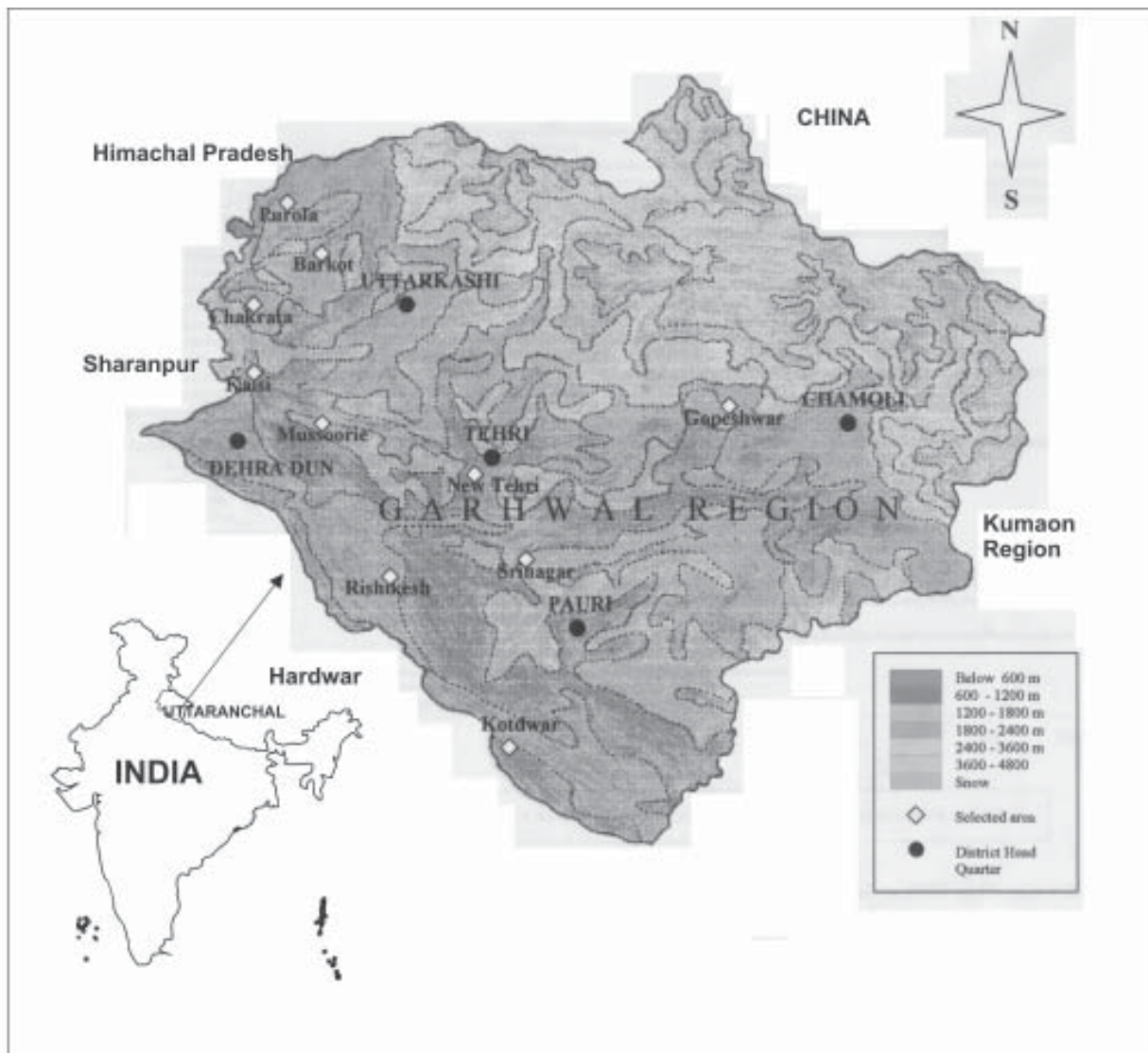
Fig. 1: Map of Garhwal region showing study area at different altitudes

Methodology : Adult mosquito sampling and immature collection was done as per WHO 17 guidelines. The collected mosquito's specimens were first of all narcotized with petroleum ether and thereafter they were identified using keys and catalogues 18-23 .