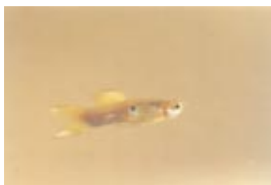
Poecilia reticulata (guppy)