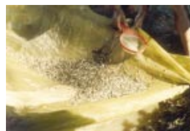
Mass production of Fish

was undertaken in Rapar taluka during 2005–07 with the objectives to assess the impact of A. dispar on malaria vector population, malaria prevalence, operational feasibility, social acceptance and sustainability of A. dispar under the vector-borne disease control programme. Results of the trial indicate that the fish is highly effective in malaria vector control and propagates very well in brackish water as well freshwater in the earthen and concrete irrigation tanks, wells where malaria vector An. culicifacies and An. stephensi breed profusely. Monitoring of the incidence of malaria by routine surveillance system and cross-sectional surveys indicated that the fish use was as effective as IRS. The SPR in the fish area was 1.4% compared to 1.6% in the IRS area (Fig. 62). The acceptance of fish by the native farming community was high.