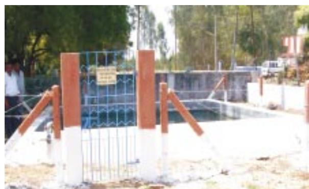
Larvivorous fish hatchery

Suitable fish species and rate of application in different breeding habitats for the control of different mosquito vector species are shown in Table 2. Use of larvivorous fish for vector control is a simple, inexpensive, effective and local measure. Larvivorous fish has been accepted as a selective vector control method in the Enhanced Malaria Control Projects launched with World Bank financing in eight states of India since 1997. An independent assessment of the performance of the larvivorous fish programme as an integrated control measure was carried out in Ahmedabad City and in rural areas of Nagpur (Maharashtra) and Chhindwara (Madhya Pradesh) districts during 2003–04. The assessment included the status of development of fish resources, introduction of larvivorous fish and maintenance of hatcheries, methodologies adopted for producing fish