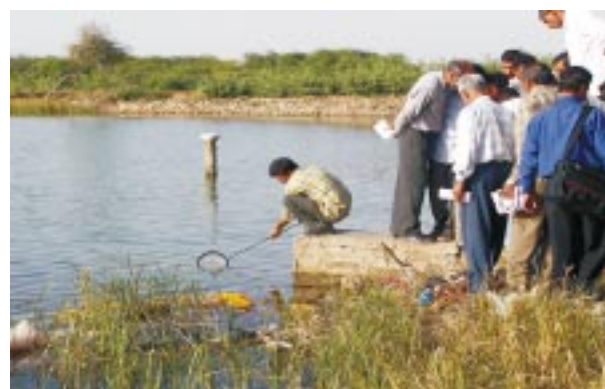
Training on collection of fish

stocks, transportation and distribution/release, available infrastructure and manpower, training needs, social acceptance and community perception. The impact of the larvivorous fish on the mosquito borne diseases and the sustainability of the larvivorous fish programme was also assessed. It was observed that the use of larvivorous fish in malaria